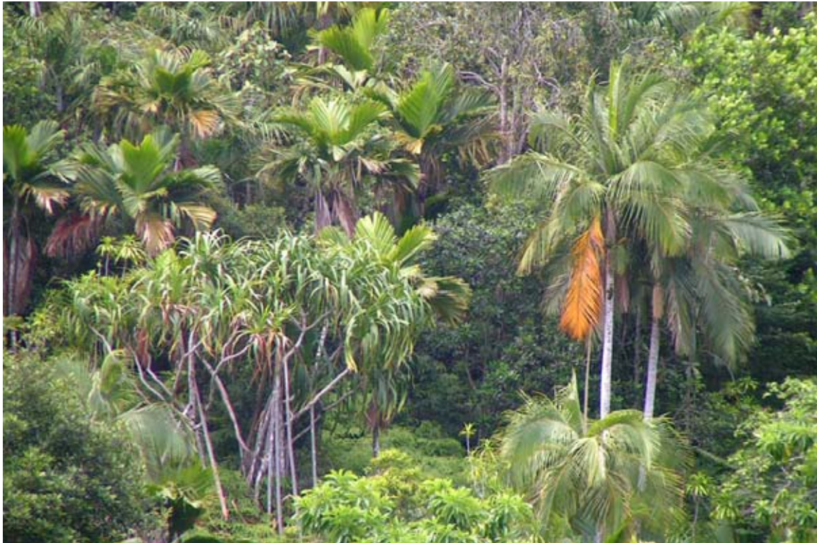
Palms and Pandans growing naturally at Vallée de Mai (L Chong-Seng).