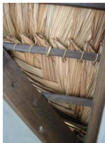
Modern thatching the traditional way - using Latanniyen fey leaves and Coco-de-mer 'zig' string. The photo shows the inside of the roof.

Being able to transport and store water was essential. Not surprisingly, the huge nuts of Coco-de-mer palms were utilised for water storage, as were the large leaf bases of Palmis, which when fresh are pliable and can be pinned up to form containers ('basen'). However, a more common use for these leaf