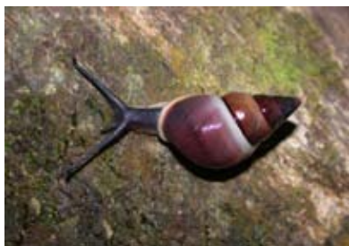
Endemic Pachnodus snail found in La Reserve (E Schumacher).

Because of the high diversity of plant species, La Reserve supports a number of endemic and indigenous animals, including birds, bats, reptiles and insects. Among the endemic bird species are the Seychelles Blue pigeon, Sunbird, Kestrel and Bulbul. Perhaps the most interesting creatures found in La Reserve are the endemic chameleon, stick insects and land snails.