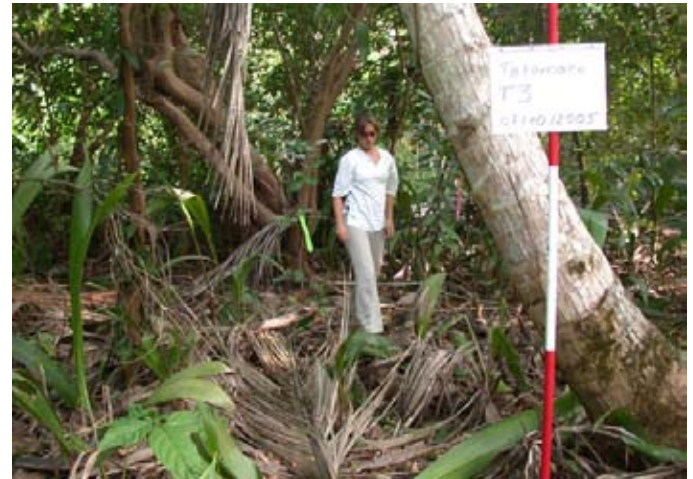
Field Work on North Island (C Ramseier).

Rehabilitation is defined as the return of an ecosystem to a close approximation of its condition prior to disturbance. This process is time consuming and will last many years. The work we did on North island is the first step in this long-term process. It forms part of the Rehabilitation of Island Ecosystems project led by the Island Conservation Society and funded by FFEM (French GEF), the objective of which is to rehabilitate a number of islands in Seychelles inclu-