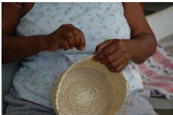
Praslin lady creating a hat with a long plait made of soft immature leaf of Coco-de-mer (L Chong-Seng).

When settlers arrived in Seychelles in the late 18th Century, they found many uses for the native plants, including the endemic palms and pandans. Shelter was a primary consideration and Latanniyen fey leaves were used for thatching house roofs. On Praslin the much larger Coco-de-mer leaves were utilised, with their huge leaf stalks creating attractive ornamental roof ridges and corners. However, W H Est-ridge in 1885 reported that “although much cooler, thatched houses are not so pleasant for hot climates on account of the centipedes and other pests they harbour”! Palm leaves could also be used for house walls and inner partitions, but more substantial walls were created from lathes ('lat'). The trunk of a Latanniyen lat was split into four and the softer inner part removed, leaving one inch thick lathes which could be arranged in attractive patterns. The long aerial roots of Vakwa maron were also utilised in this way but because of their smaller size were split into just two pieces (known as 'lati').