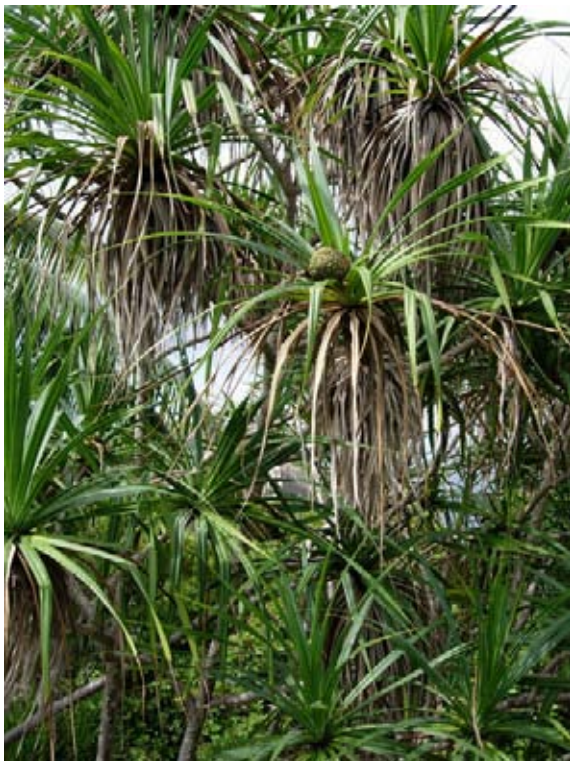
Pandanus balfourii (C Ramseier & S Mannes).

Everybody who visits North Island for the first time is taken aback by the huge number of coconut palms growing on the island. This is due to North Island's history as a coconut plantation in the 19th and 20th centuries. After some years of relative neglect, in 1997 the island was purchased by a group of shareholders who built North Island Lodge, a tourist establishment. They realized that the island's flora and fauna was in a bad condition – generally speaking, over 90% of the landscape was sculptured by man. Fortunately the North Island Lodge management is committed to rehabilitating the island, working together with local experts.