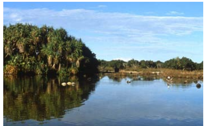
P. tectorius growing next to a freshwater pool at Aldabra (L Chong-Seng).

To re-establish the productivity and some, but not necessarily all, of the plant and animal species thought to be originally present at the site. For ecological or economic reasons the new habitat might also include species not originally present at the site. The protective function and many of the ecological services of the original habitat may be re-established.