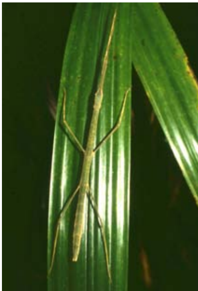
The stick insect Graeffea seychellensis.