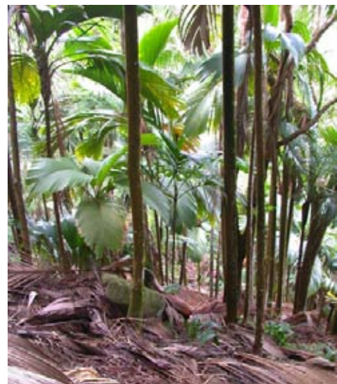
Palm forest at La Reserve (E Schumacher).

And, it must be pointed out that all is not well in La Reserve. There are various threats which pose a danger to the whole ecosystem. Well known invasive species have established and thrive within the reserve. Species such as Bracken fern and Prindefrans are localised; but others such as Wild guava, Alstonia and the creeper Merremia peltata are more widespread and pose a real threat. Merremia seems to have established a real foothold in the reserve and its rate of invasion should be of real concern to the authorities. In addition, several Bwa dou trees have been felled by unscrupulous collectors of medicinal plant material. Other highly threatened species may be subjected to the same fate as no effort is being made to apply sustainable collection practices.