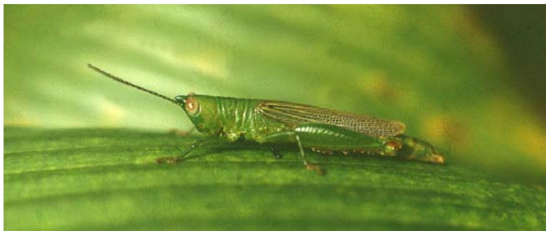
Gardiner's grasshopper ( Enoplotettix gardineri ) (K Beaver).

There is much scope for further research on the insect fauna of palms and pandans in Seychelles. Which insects are obligate associates (cannot survive elsewhere) and which are only frequent (opportunistic or facultative) associates? Which species are associated with which species of palm or pandan? The answers to these questions, like the life histories of most of these insects, have yet to be worked out. Of course, it is vital that we keep on protecting our remaining palm and pandan forests, because their destruction would mean the disappearance of these unique animal communities.