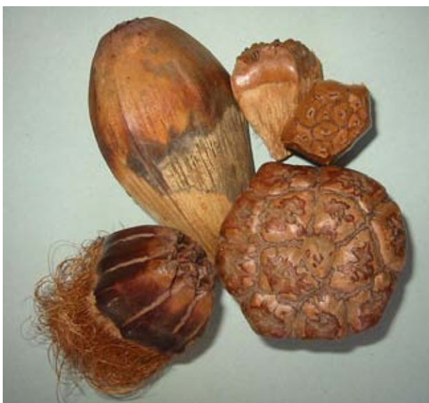
Phalanges (fruit sections) from 2 trees of P. tectorius (right) showing typical variation in size and structure, alongside those of P. hornei (top left) and P. sechellarum (bottom left).

Aldabra atoll has a completely different geological history from the granitic islands. It has a more recent origin and is formed entirely of limestone. The plants are mostly of African/Malagasy origin. Vast areas are covered with Pemphis scrub and mixed scrub, and the lagoon is fringed with mangroves. There are a significant number of endemic species and sub-species, which is unusual for an atoll and partly a result of the large and varied terrain of Aldabra.