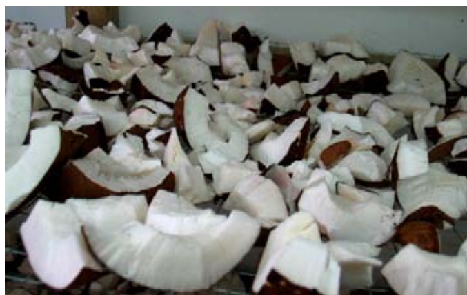
Coco-de-mer kernel being dried before export to the Far East.

Nevertheless, because of the relative lack of information on the life cycle of Lodoicea it is imperative that the Precautionary Principle be used, particularly until such time as monitoring data can be fed into the management and decision-making process. Adaptive management is identified as crucial, to ensure sustainable exploitation; that is, management has to integrate research results directly into the conservation strategy for Lodoicea . In the mean time a conservative approach has to be taken towards, for example, the number of nuts left in the forests for regeneration. In addition, the application of legislation as a tool in the conservation of Lodoicea has been reviewed and the current Coco-de-mer Management Decree will require updating to be effective.