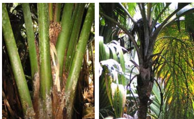
Micro-habitats in juvenile Coco-de-mer and Latannien fey.