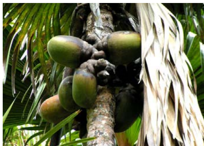
Coco-de-mer fruits (L Chong-Seng).

The amazing nature of both the tree and its seeds has captured the interest of a wide range of people, from rulers such as the Hapsburg Emperor Rudolph II to General Gordon of Khartoum; and from the olden-time pilgrims to Mecca, to the first Seychelles settlers, whose traditional uses of the palm were many and varied (see p 13). Nowadays, the seeds are still greatly valued and therefore harvested. Alt-